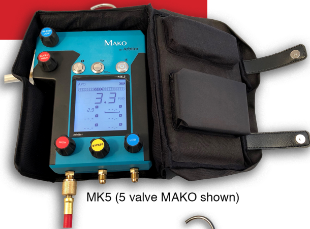
MK5 (5 valve MAKO shown)